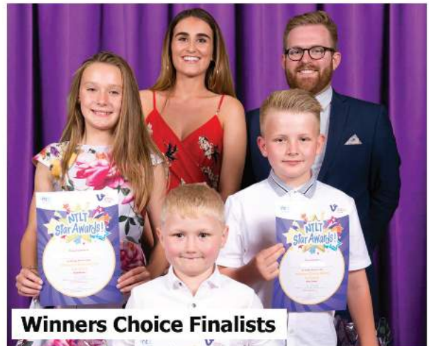
Winners Choice Finalists