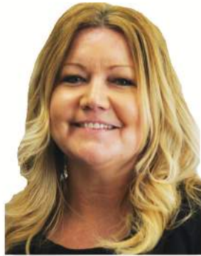
Tracey Crowder Secondary