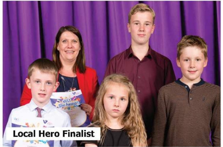
Local Hero Finalist