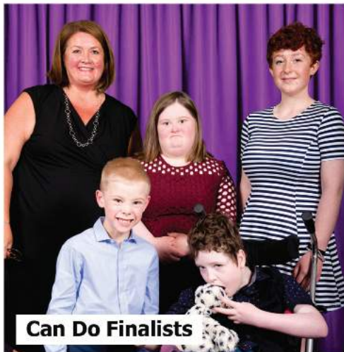
Can Do Finalists