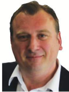
Peter Gannon Special Schools