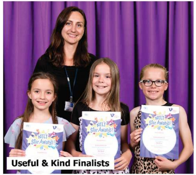
Useful & Kind Finalists